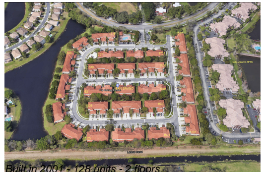
Built in 2001 - 128 units - 2 floors