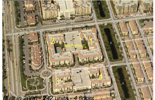
Built in 2006 - 242 units - 4 floors