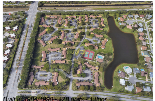
Built in 1984/1990 - 128 units - 1 floor