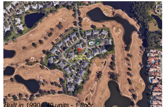
Built in 1990 - 40 units - 1 floor