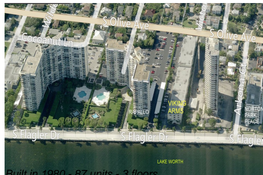
Built in 1980 - 87 units - 3 floors