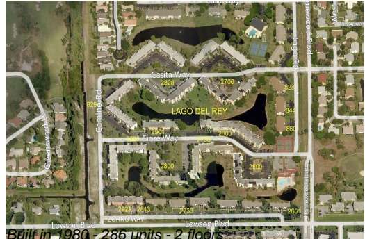
Built in 1980 - 286 units - 2 floors