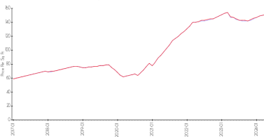
Forest Lake vs Port Richey