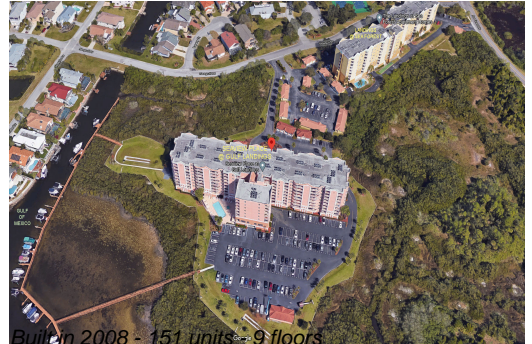
Built in 2008 - 151 units - 9 floors