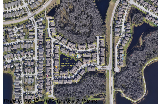
Built in 2005 - 162 units - 2 floors

17530 Stinchar Dr - 17436-17552 Stinchar Dr, Land O Lakes, FL, Pasco 34638