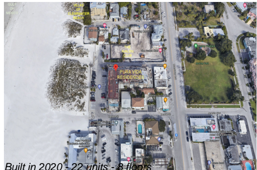
Built in 2020 - 22 units - 3 floors