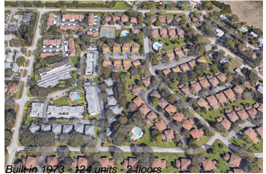
Built in 1973 - 124 units - 2 floors