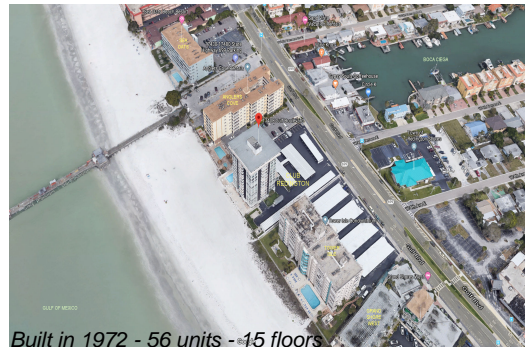
Built in 1972 - 56 units - 15 floors