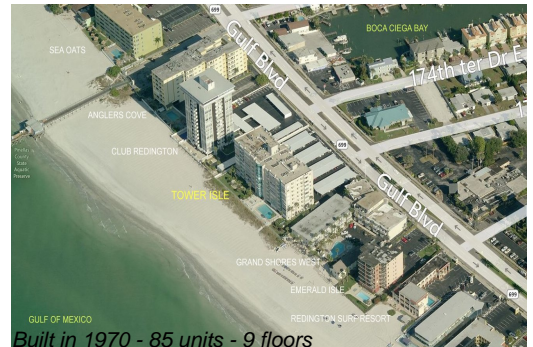
Built in 1970 - 85 units - 9 floors