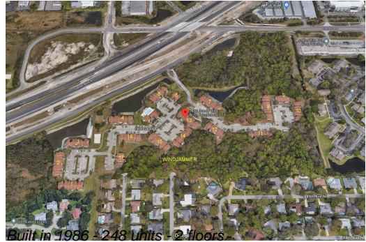
Built in 1986 - 248 units - 2 floors