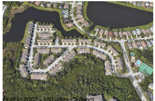
Built in 2002 - 150 units - 2 floors