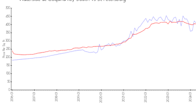
Waterside at Coquina Key South vs St Petersburg

Waterside at Coquina Key South: $411/sq. ft. St Petersburg: $404/sq. ft.