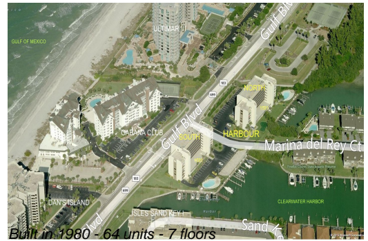
Built in 1980 - 64 units - 7 floors