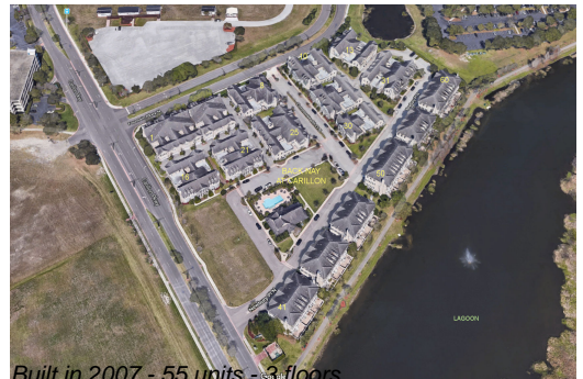
Built in 2007 - 55 units - 3 floors