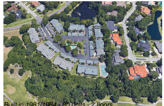
Built in 1981/1984 - 80 units - 2 floors