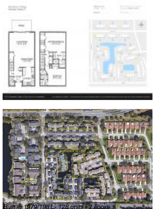
Built in 1979/1981 - 128 units - 2 floors