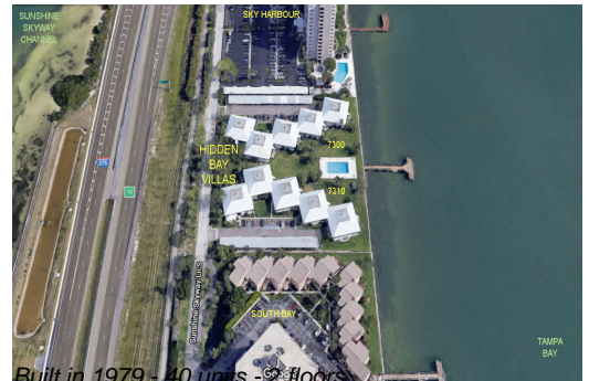
Built in 1979 - 40 units - 2 floors