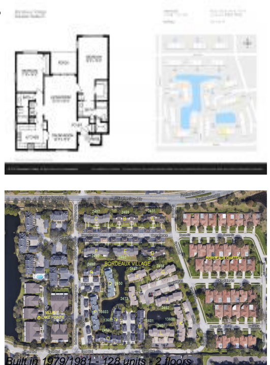
Built in 1979/1981 - 128 units - 2 floors