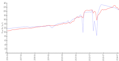
Palmbrooke Townhomes vs Pinellas Park