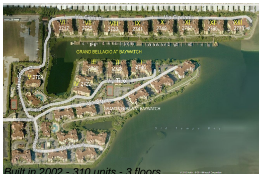
Built in 2002 - 310 units - 3 floors

Grand Bellagio at Baywatch: 10% Clearwater: 6% Pinellas: 5%