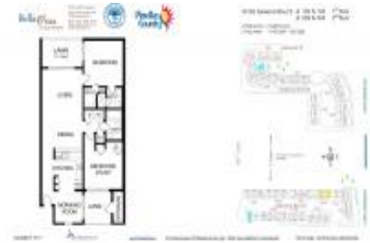
Built in 1987 - 192 units - 2 floors

The above valuated price is a baseline figure that does not take into account any specific renovation, upgrade, split, merge, or deterioration of the unit.