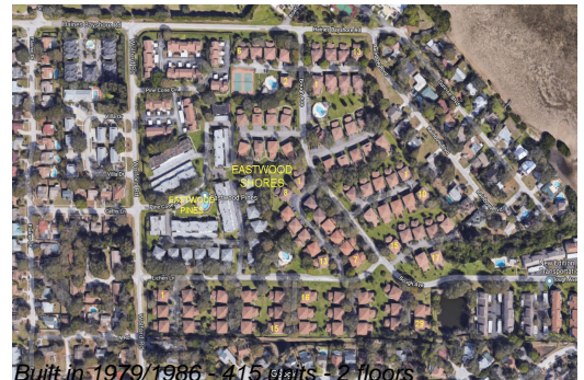
Built in 1979/1986 - 415 units - 2 floors