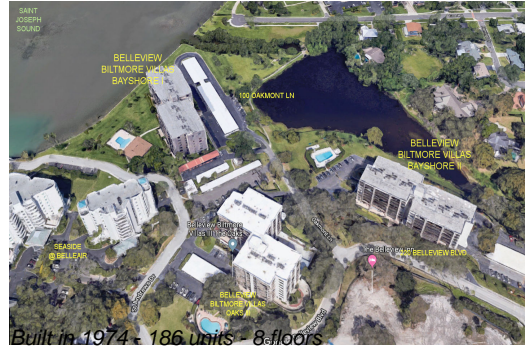
Built in 1974 - 186 units - 8 floors