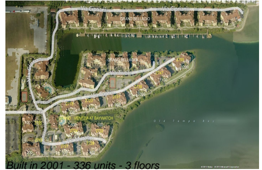
Built in 2001 - 336 units - 3 floors