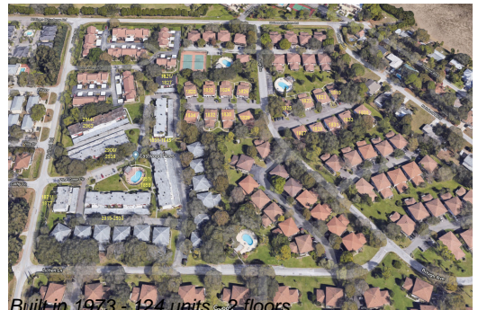
Built in 1973 - 124 units - 2 floors