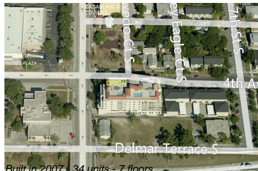
Built in 2007 - 34 units - 7 floors