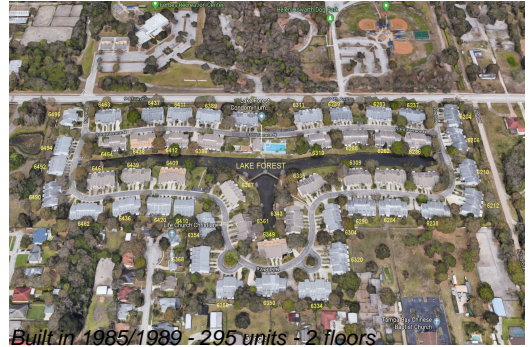
Built in 1985/1989 - 295 units - 2 floors