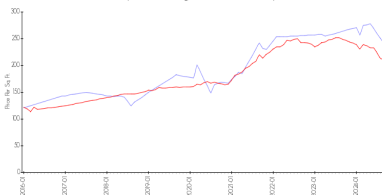
Town Shores of Gulfport - Nottingham House vs Gulfport