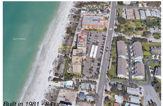
Built in 1981 - 84 units