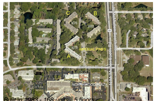
Built in 1983 - 168 units - 5 floors