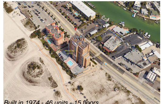
Built in 1974 - 46 units - 15 floors