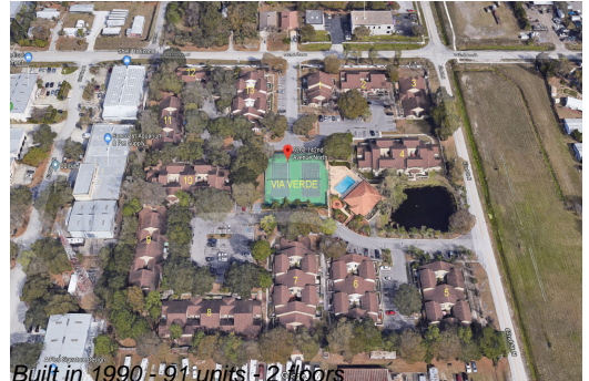
Built in 1990 - 91 units - 2 floors