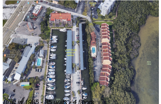
Built in 1985 - 35 units - 4 floors