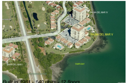
Built in 1981 - 140 units - 12 floors