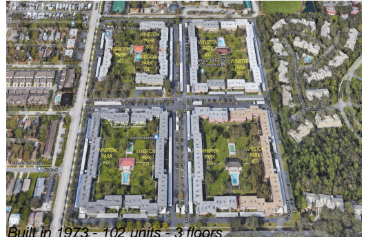
Built in 1973 - 102 units - 3 floors