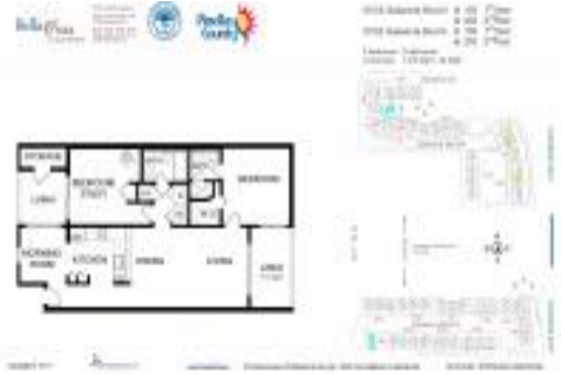
Built in 1987 - 192 units - 2 floors

The above valuated price is a baseline figure that does not take into account any specific renovation, upgrade, split, merge, or deterioration of the unit.