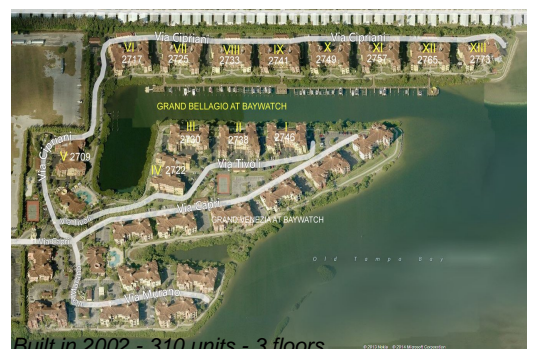
Built in 2002 - 310 units - 3 floors