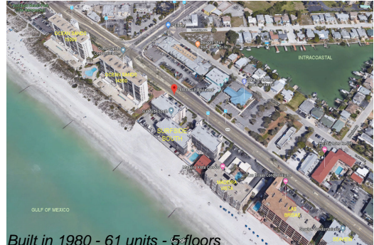
Built in 1980 - 61 units - 5 floors