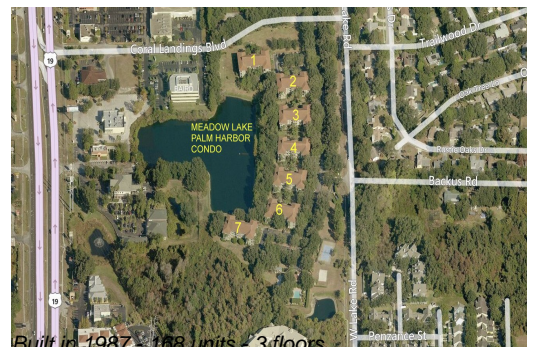
Built in 1987 - 168 units - 3 floors

Meadow Lake 36 days Palm Harbor 70 days Pinellas 85 days