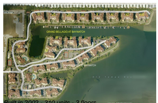
Built in 2002 - 310 units - 3 floors

Grand Bellagio at Baywatch 17% Clearwater 8%