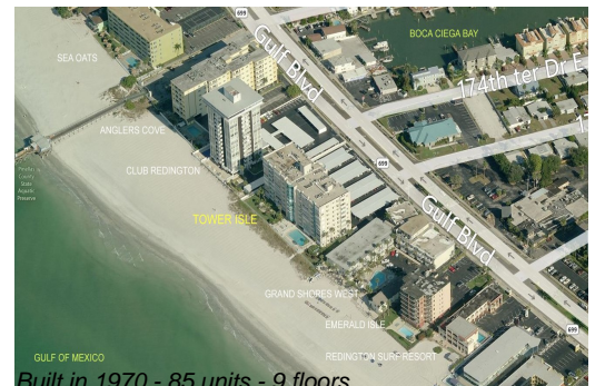
Built in 1970 - 85 units - 9 floors