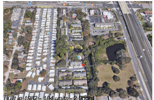
Built in 1982 - 104 units - 2 floors