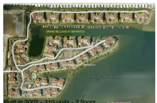
Built in 2002 - 310 units - 3 floors