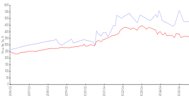
Sunrise @ Harbourside (7963&7979) vs South Pasadena