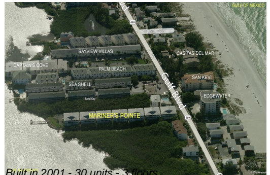
Built in 2001 - 30 units - 3 floors