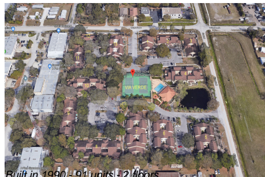
Built in 1990 - 91 units - 12 floors